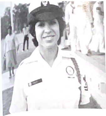
RM 2 FOLEY Company Commander