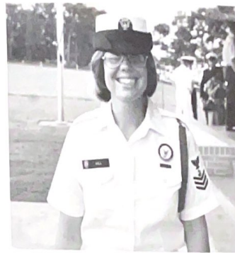
NC 1 HILL Company Commander